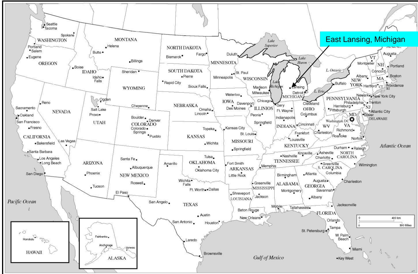
MAJOR U.S. CITIES

Produced by the Dept. of Geography The University of Alabama